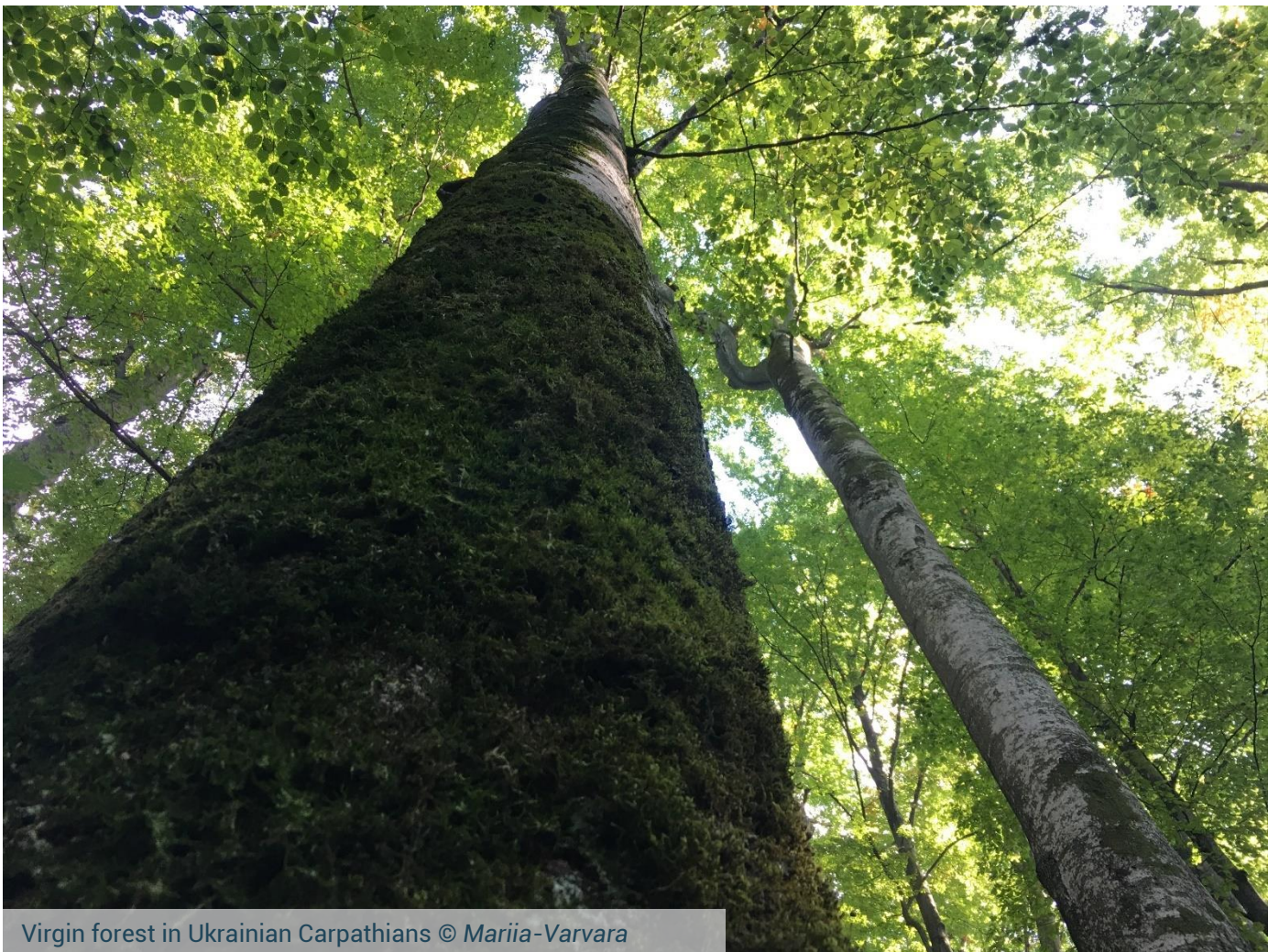
Virgin forest in Ukrainian Carpathians