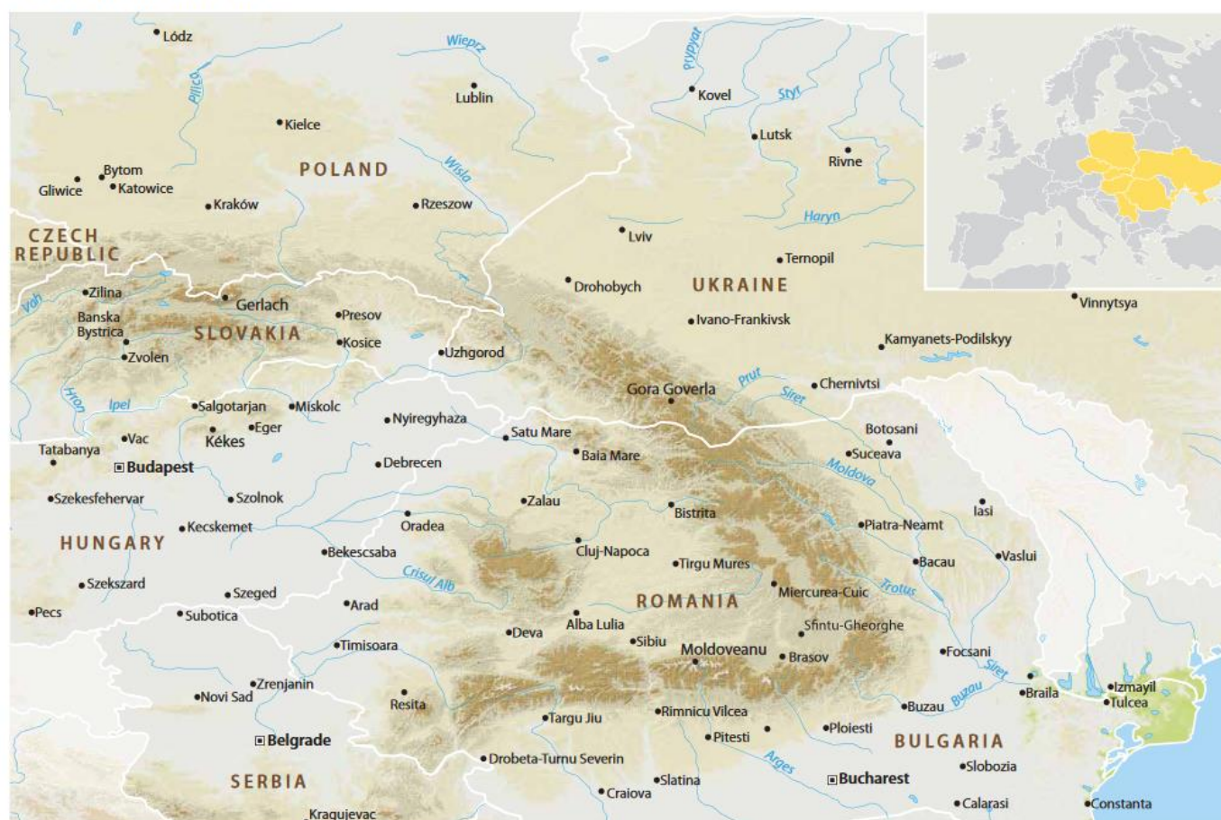
Figure 1. The Carpathian region territory covering seven countries. (GRID-Arendal, 2014) 2

For this reason, the Carpathian region is recognized as having global cultural and ecological significance by the United Nations Educational, Scientific and Cultural Organization (UNESCO). Large, uninterrupted and inaccessible expanses of forests provide refuge for populations of large European mammal species, such as the lynx, river otter, grey wolf, woodland bison, red deer, moose and brown bear. Found only in this region are over 200 species of endemic plants and stands of virgin 3 European beech forests with areas larger than 10,000 ha. Subranges like the Făgăraș in